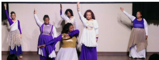
Heavenly Doves Ministries