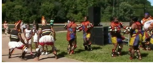
Ijo Ugo Dancers