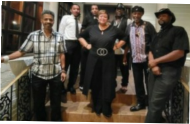
Positive Vibe Band