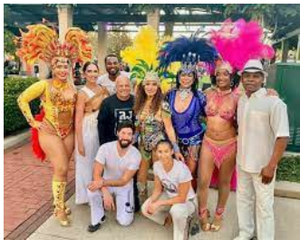
Cincy Brazil Samba Dancers